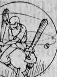
HITS RIGHT OR LEFT HANDED