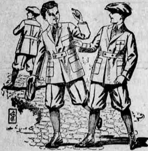
Our New Displays Are Ready!

Boys Two-Pant Suits in the season's best styles. Good, serviceable fabrics, in brown, grey, tan, blue and green mixtures in cassimeres and tweeds. Shown in belted models with patch pockets. Just the style—popular with every boy. At this low price range of