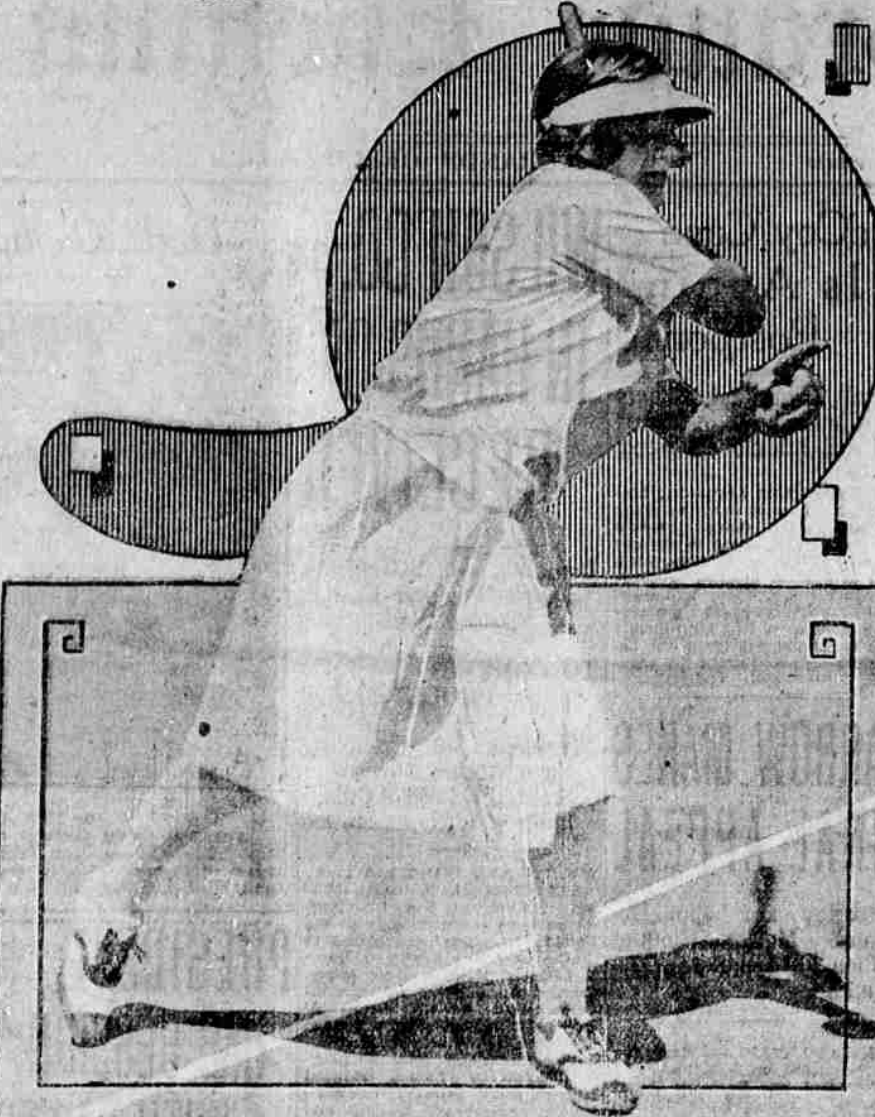
"Lady-in-waiting to Queen Helen Wills" is the title which California has bestowed upon Helen Jacobs, 15-year-old girl tennis star of Berkeley, Calif. Experts agree that Miss Jacobs is potentially another Helen Wills. Some of them say she is further advanced now than was Miss Wills at the same age. Miss Jacobs makes her debut in the east next month as a competitor in the national junior-championships at Philadelphia.