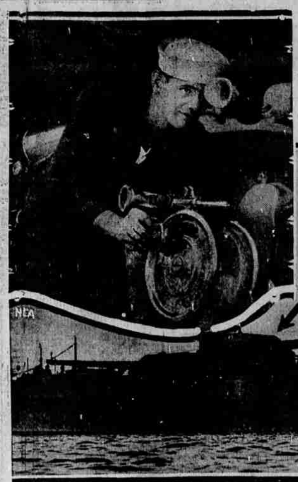
The turret, indicated by arrow in lower photograph, of the dreadnaught Mississippi, which became the death chamber of 48 U. S. navy officers and sailors off San Pedro Harbor, Calif., during range practice when a heavy charge of high explosive, mysteriously ignited, flared back from the gun breach, filling the turret with deadly gases.