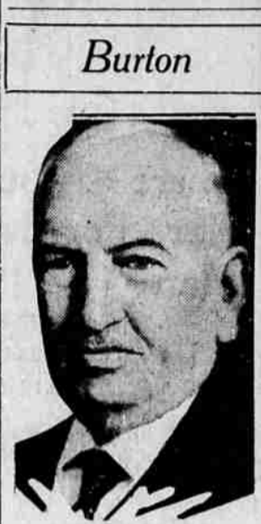
Theodore Burton, who delivered the keynote address today at the opening of the Republican National Convention in Cleveland, Ohio.