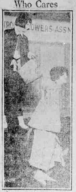
Who Cares DANCING DANCING ASSN

Just the thing for summer enjoyment. You can carry it around in your pocket. It's one of the new waterproof paper suits. It's a pocket and when the showers start, put it on.