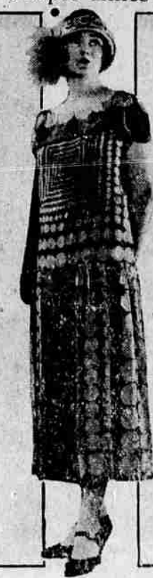
The line of this frock is very simple though the effect is stunning. It is merely a waisted bodice joined to a skirt and a shaped collar about the neck falling on the shoulders so as to give the effect of a shawl. The bodice is hand-blocked pussy white with graduated dots of white on a navy blue surface.