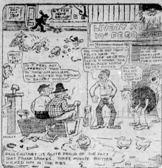
LIVERY STABLE 10¢ FEED