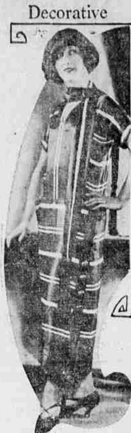
Black and white striped satin, such as this, is so decorative in itself that even cut on the simplest lines it takes on an elaborate air. Here the stripes go round on the skirt and under the arms but go up and down on the sleeves and front. Six wide tucks at the hem, a few steel-colored buttons and a tansel scarf are effectively used.

CANDY We are offering you freshly tined Peanut and Raisin Clusters at 35c the Pound for Wednesday, May 21 only. WATCH FOR OUR DAILY SPECIALS! The Candy Shop 220 FIR ST. The Home of Home Made Candy