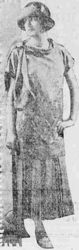
This attractive sport costume is of jade green mohair with a blouse of crepe de chine with appliqued designs of the mohair used as a trimming. The scarf collar is new this season and is a most distinctive touch. The plants are grouped so as to give the effect of a wide-striped material.