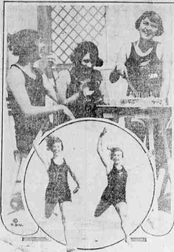
Aileen Dugan, Olympic diving champion, celebrates her 14th birthday with a "birthday suit" party at Long Beach, Long Island. Above she is cutting the birthday cake and (inset) getting up an appetite with a beach run.