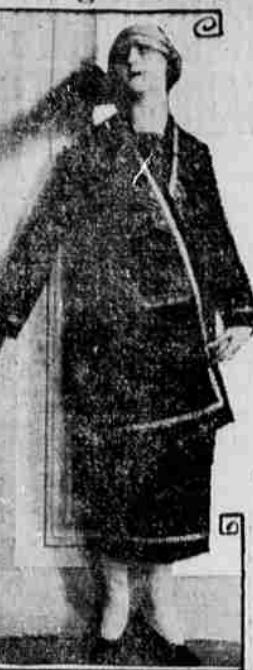
The charm of this black rep-suit which was created by Molyneux for a concert costume lies in the straight, uncomplicated lines and the judicious use of embroidery in gold and white. It is worn with an overblouse of gold tissue cloth, and a close turban of the same material.

tions of merit of one of Oregon's leading artists.