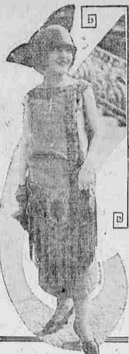
Fringe has been used with unusually good effect on this frock of beige crepe embellished with brown embroidery. The fringe is of alternate stripes of beige and brown. The line of the tunic is very smart and could be used on a less elaborate frock, edged with self material instead of fringe.

Approximately two hundred people were in attendance at the Junior-Senior banquet Saturday evening and everyone present had a delightful time. The banquet, consisting of fruit cocktail, creamed chicken in patty shells, mashed potatoes, corn in a Southern, grape sherbet, pickles, olives, hot rolls, strawberry short cake, nuts, mints and coffee, was served at 8:20 o'clock in the Home Economics department of the high school. The banquet room and tables were charmingly decorated in Dutch style, red and yellow tulle and lamps with shades in the form of tulips as center-pieces. The placards and menu was in the form of a wooden shoe and very attractively arranged at each place.