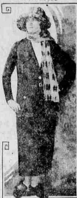
The old favorite—the Norfolk suit—has been revived along with the other variations of the suit this season. This one is of green moiré very soft and light, worn with a smart crepe hat and scarf trimmed with bands of duvetyne.