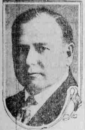
WILL R. KING Candidate for Democratic Nomination for United States Senator by Oregon

checks will be returned to unsuccessful bidders. The Commission reserves the right to reject any and all bids. By order of the Commission April 23rd, 1924. J. E. STEADMAN, Recorder of the City of La Grande, Oregon.