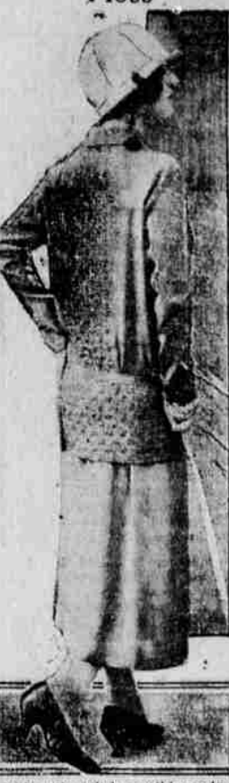
This satin suit has nothing original to offer in the way of line, but it devotes its originality to trimming. Heavy silk tuss and wooden beads the exact shade of the silk adorn the back and also the front of the belted coat.