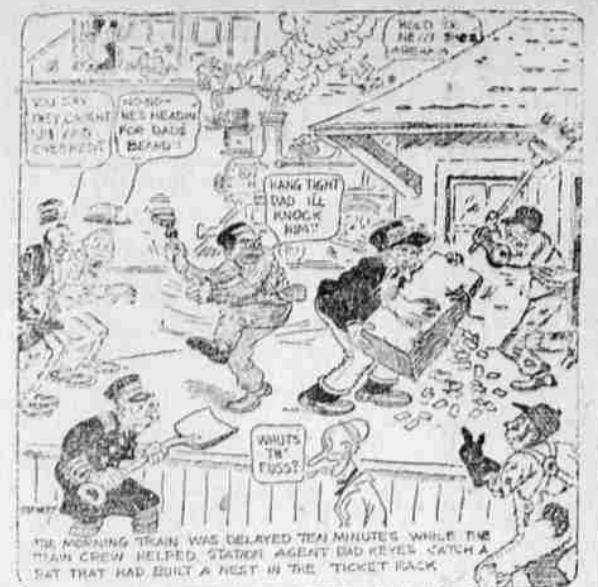
THE MORNING TRAIN WAS DELAYED TEN MINUTES WHILE THE TRAIN CREW HELPED STAMPER AGENT DAD GET A CATCH- A CAT THAT HAD BUILT A NEST IN THE TICKET PACK.