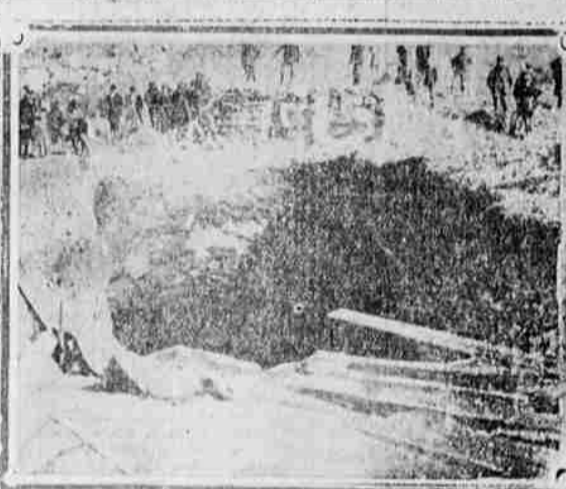
General view (upper picture) of Castle Gate, Utah, where a terrific explosion blast last Saturday took a toll of 174 lives. The upper shows the center crater, both No. 1 and No. 2 mines. The explosion occurred at the latter.