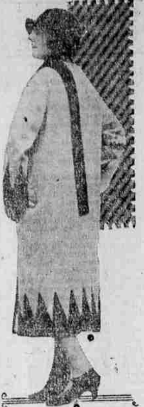
Here is a straight-line coat that gains individuality through the use of darker material applied in a pointed design about the hem and cuffs. The scarf collar is more elongated and narrow than many shown.

some of the figures used in the texture of the Japanese kimono. Various colors and designs were shown in the most recent purchases of the Crown Princess. One attractive dress was on a ground color of ivory about with cherry flowers and the lucky mandarin duck figuring in the pattern. The Japanese idea of mandarin ducks makes the birds a lucky omen to the new bride, as the males and females never separate and are models as devoted mates. Another fine design is a happy combination of the pine tree, peonies and phoenix birds. "Mitsie in Hovers" is the name of the design for the third dress. Roses of the most attractive shades are featured in another, while roosters on an ancient purple background convey a classic sentiment in still another one. One dress, which is said to be a particular favorite with the crown Princess, shows bright spring flowers on a purple background.