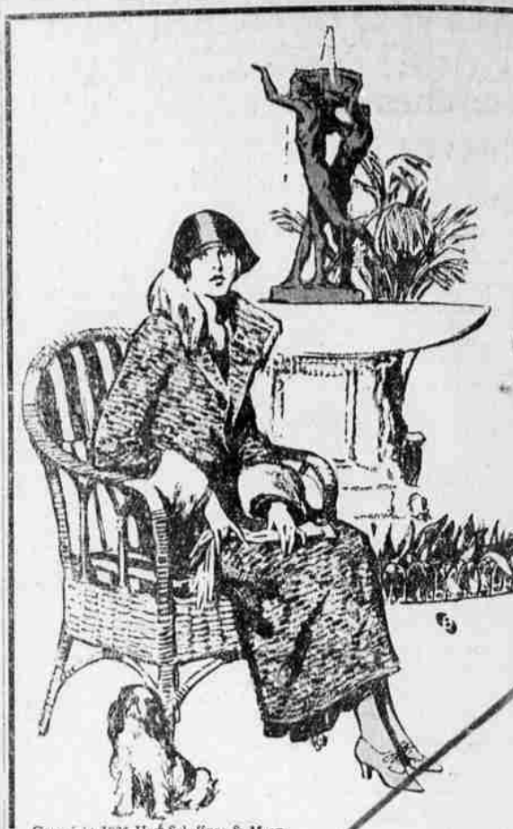
Copyright 1924 Hart Schaffner & Marx