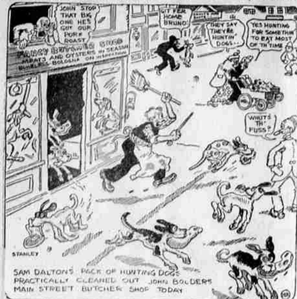
SAM DALTON'S PACK OF HUNTING DOGS PRACTICALLY CLEARED OUT JOHN BOLDBER'S MAIN STREET BUTCHER SHOP TODAY