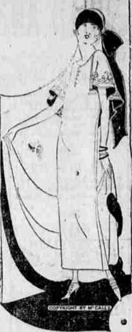
Tiny capes form the sleeves of the new straight dress of heavy satin. Just a little gathering on each shoulder adjusts the neckline—for the rest the dress is as a dress can be. The model is suitable to silk crepe or satin in any of the popular colors and would be decidedly attractive in velvet. It may be worn with or without a belt according to one's personal taste.

Judge Landis says he will root for team in a cellar next year. Other fans are expected to do all their rooting in the bleachers.