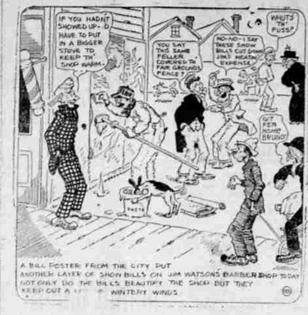
A BILL POSTER FROM THE CITY PUT ANOTHER LAYER OF SHOW BILLS ON JIM WATSON'S BARBERSHOP TODAY NOT ONLY DO THE BILLS BEAUTIFY THE SHOP BUT THEY KEEP OUT A LOT OF WINTER WINDS.