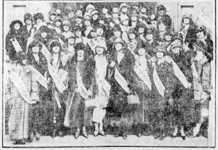
Beautiful girls don't come from any one state. This bevy was recruited from many, as their banners might show. They stopped off at Washington to see the White House while en route to New York City where they are to participate in a huge beauty spectacle—one to be crowned Queen of Beauty in America.