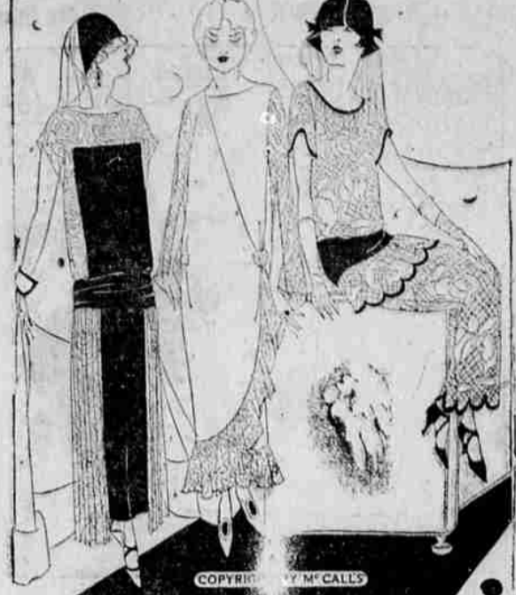
Sketches here are afternoon tees which show just how lovely lace may be when it goes out to afternoon tea. Black lace is the whole material of one frock made over a colored silk slip. Lace forms the yoke and plated panels of another. Brown lace and brown silk are used for the third model. The laces are all-over patterns, Spanish or Chantilly, soft and silky in texture. They are used in all colors though black and brown are most popular.