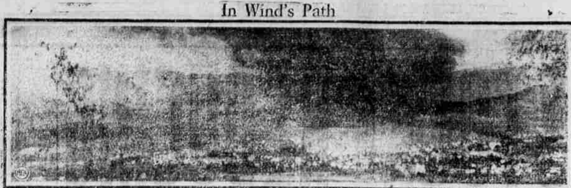
Photo shows Verdugo Valley (Cal.) fire, which, fanned by strong winds, swept miles of forest timber and threatened Pasadena and other cities. Many summer homes were destroyed.