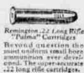
Remington .22 Long Rifle "Palma" Cartridge. Beyond question the most uniform small bore ammunition ever developed. The super-accurate .22 long rifle cartridge.