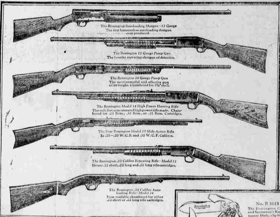
The Remington Autoloading Shotgun—12 Gauge. The first hammerless autoloading shotgun ever produced.