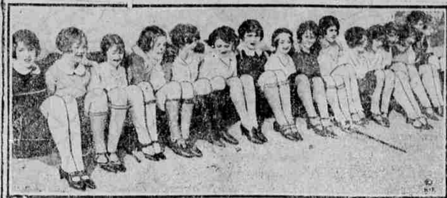
Society girls of the younger set of Washington resting during a rehearsal of the musical comedy "Name It," which they will give on Oct. 19 for benefit of the Women's Universal Alliance.