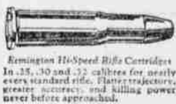
Remington Hi-Speed Rifle Cartridge. In .25, .30 and .32 calibers for nearly every standard rifle. Flatter trajectory, greater accuracy, and killing power never before approached.

The first successful metallic cartridges ever made were produced by Remington 65 years ago. Practically every betterment in rifle and pistol ammunition has been invented and developed by Remington. Dependability and accuracy make Remington Cartridges outsell all others.