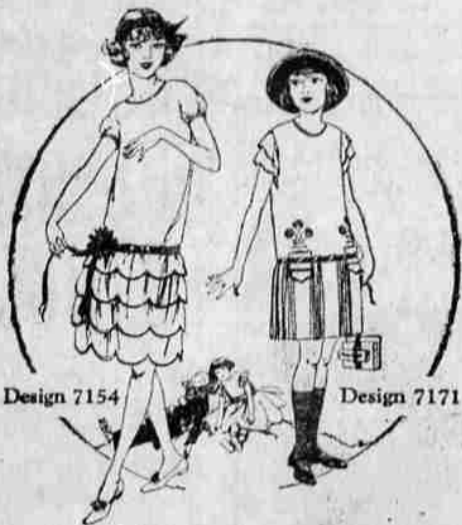
Design 7154 Design 7171

Make them dresses they are proud to wear!