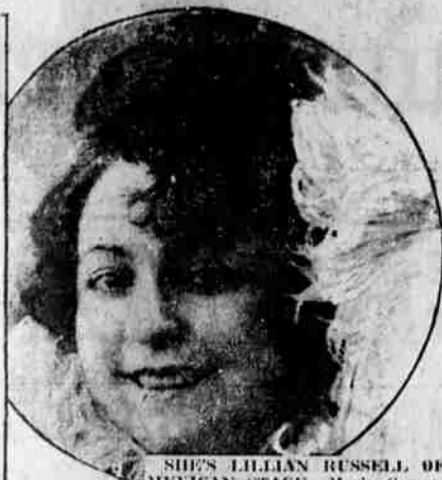
SHE'S LILLIAN RUSSELL OF MEXICAN STAGE. Maria Conesa, regarded as the most beautiful actress in Mexico, probably will be seen in the United States soon. She's planning to strut out before Yankee audiences. Her salary, 'tis said, totals several thousand pesos weekly.

"French submarines could prevent this just as little as the German U-