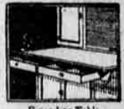
Extending Table, Drawer Section, with Porcelain Work Table

W. H. Bohnenkamp Co. Four Floors of Fine Furniture