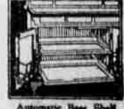
Automatic Base Shelf Extender