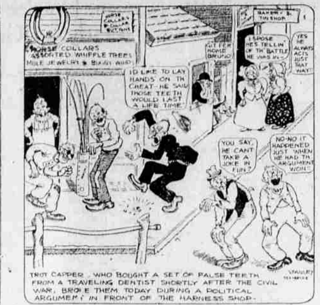
TRIP CAPPER, WHO BOUGHT A SET OF FALSE TEETH FROM A TRAVELING DENTIST SHORTLY AFTER THE CIVIL WAR, IS HERE TODAY DURING A POLITICAL ARGUMENT IN FRONT OF THE HARNES SHOP.