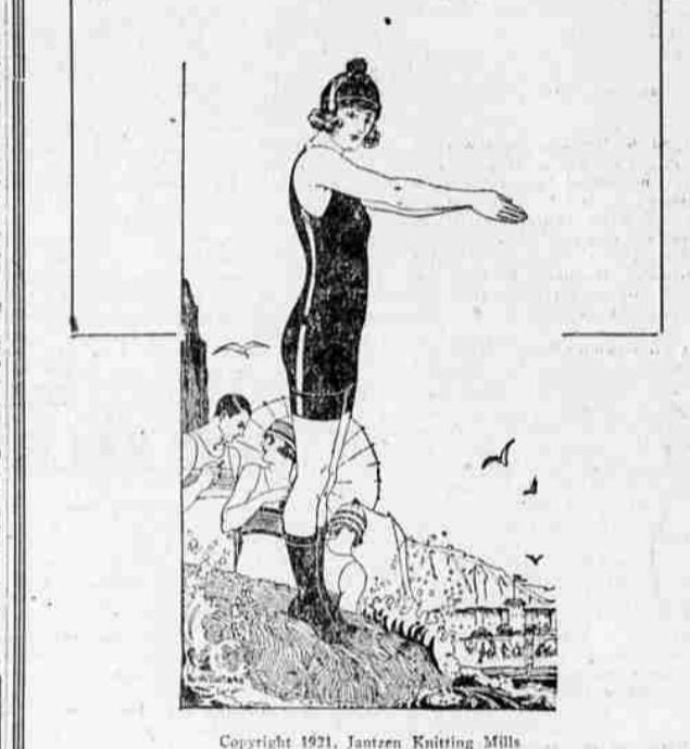
Copyright 1921, Jantzen Knitting Mills

Just slip on a Jantzen Swimming Suit and get all the pleasure of water sports. There is a difference in suits—long fibre wool, woven in the new elastic stitch makes one's suit hold close to the body without binding. Just ask for a Jantzen Swimming Suit and you have a super garment in every detail. Men's Women's and Children's sizes in desirable colors and stripes at reasonable prices. See the window display.