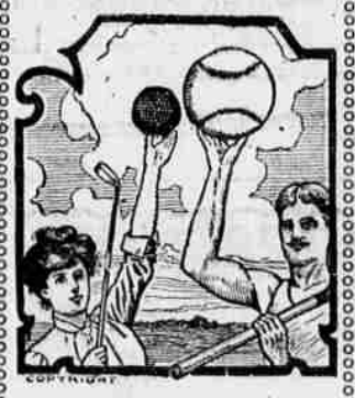
HELD HIGH in the estimation of the athlete is our tennis, golf, baseball and sporting goods generally. On the diamond, the golf links, tennis courts, or on the lake, brook or river, our up-to-date goods are in demand. If you are going on a fishing trip don't neglect to secure our up-to-date flies, rods, reels, baskets or spinners.