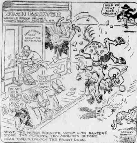
NEWT, THE HORSE BREAKER, WENT INTO BANTER'S STORE THIS MORNING, TEN MINUTES BEFORE NOAH COULD UNLOCK THE FRONT DOOR.

greatness. One to do the stunt and one to cheer.