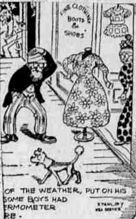
OF THE WEATHER, PUT ON HIS SOME BOYS HAD THERMOMETER

THE I. & L. DRUG CO. PRESCRIPTION DISPENSARY