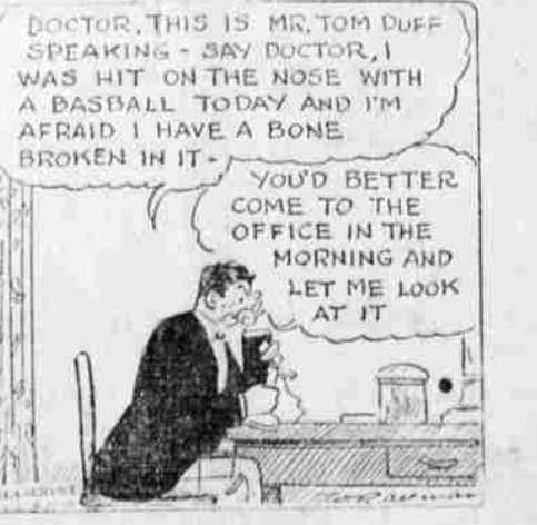
Tom Fouled a Fast One