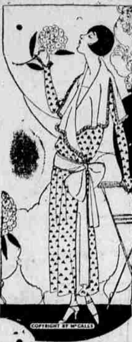
Foulard, as always, is one of the best of summer silks. It is seen in gay colors than foulard usually adopts, however. Fluted ruffles, edge sleeves, skirts and necklines and cascade from waist to hem in graceful drapes.