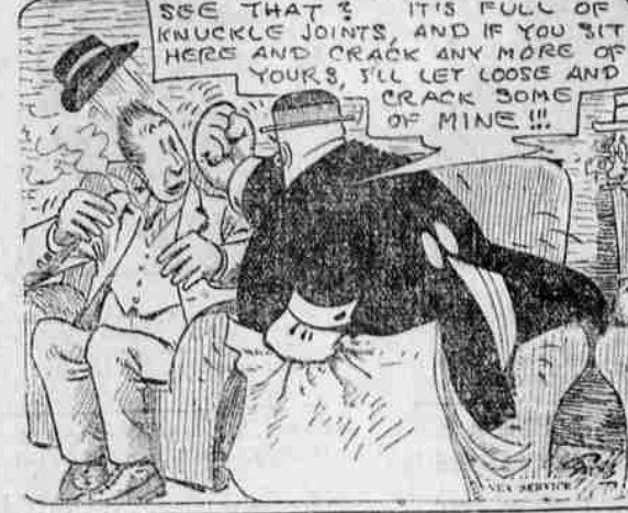
SEE THAT IT'S FULL OF KNUCKLE JOINTS, AND IF YOU SIT HERE AND CRACK ANY MORE OF YOURS, I'LL LET LOOSE AND CRACK SOME OF MINE!!!