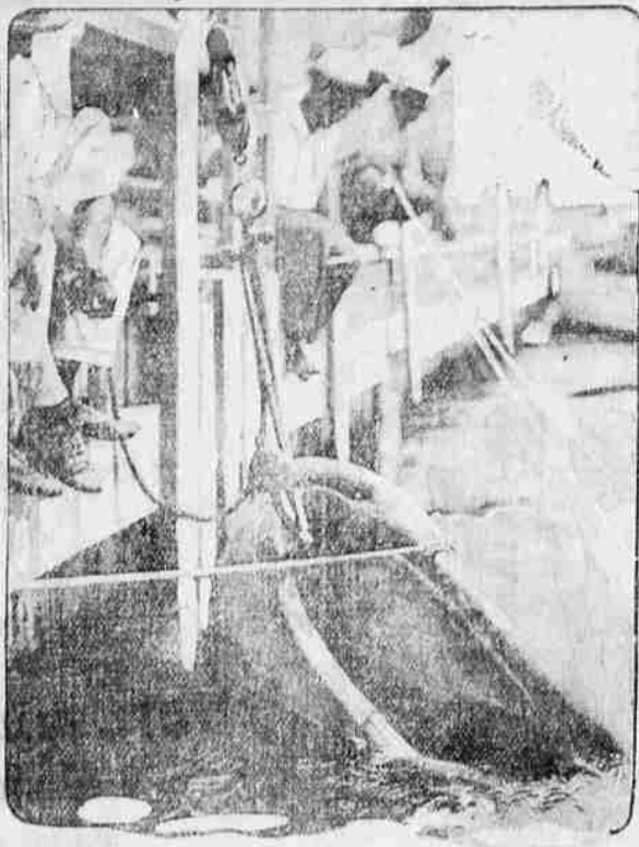
After this 40,000-pound sea monster was harpooned off Long Key, Fla., it put up a 15-hour fight that ended only when 50 bullets from a high-power rifle were fired into it. It is 33 feet long, 23 feet in girth, with a tail span of 12 feet. Naturalists say it belongs to a rare family called the "Indo-Pacific basking shark," part whale and part shark. An idea of its size may be had from this view of its mouth, only partly seen.