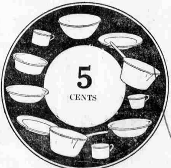
WHAT 5c WILL BUY Regular Values Up to 50c

To introduce this ware the factory has enabled us to place these articles before you at these wonderful sale prices. This sale will attract crowds of buyers—We urge an early attendance so you won't be disappointed. Hundreds of Housekeepers will be made happy because of this remarkable Special Sale of enameled ware. Probably never again will it be possible for us to offer you such sensational values.