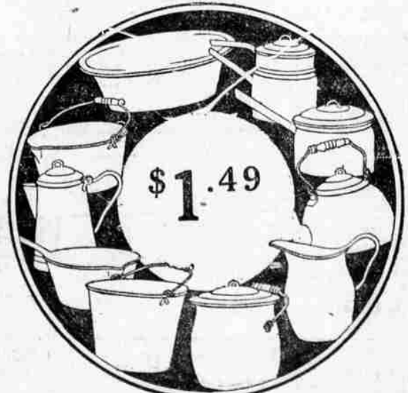
WHAT $1.49 WILL BUY Regular Values Up to $2.25

Oregon Hardware & Implement Co., Inc. La Grande, Oregon