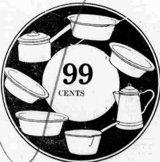
WHAT 99c WILL BUY Regular Values Up to $1.75