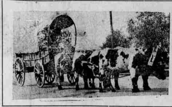
EZRA MEEKER'S OX-DRAWN COVERED WAGON