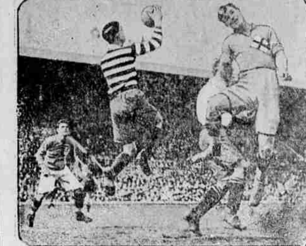
An exciting moment during a football match between the Swedish team and British team played in the Olympic Stadium in Stockholm, when four of the players were literally swept off their feet.

The more we read about China, the less we worry about Japan's effort to monopolize it.