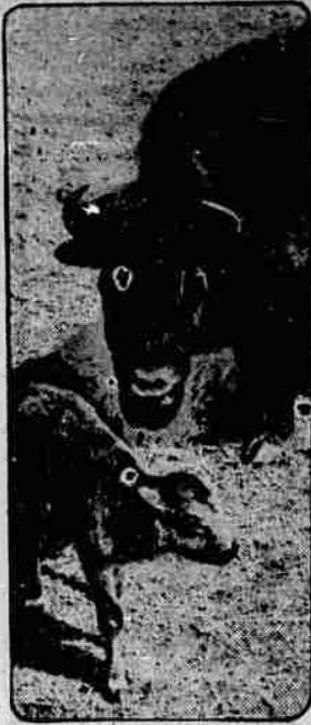
Of course, the stork's always at the zoo. That's why you see so many pictures of different sorts of little babies. Here's Mama Buffalo and Little Buff just two hours after Little Buff arrived at the Bronx Zoo, New York.