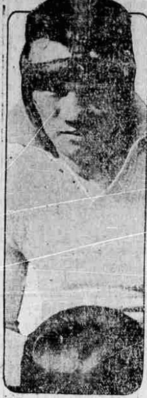
Eugene Criqui, in his protective helmet, photographed at Manhasset, Long Island, where he is training for his bout with Johnny Williams for the world's featherweight championship.