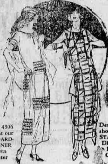
Design 4306 shown at our STANDARD-DESIGNER Pattern Counter

Blending Colors Enhance the Simple Summer Styles