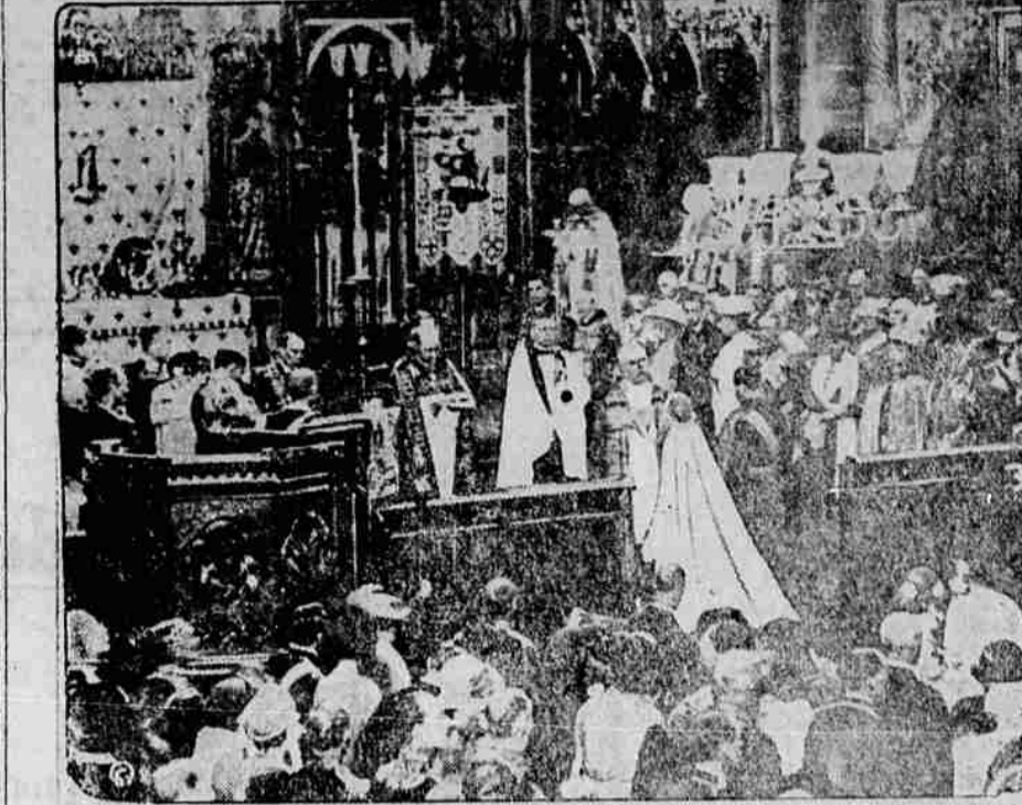
Prince Albert, Duke of York and second son of England's king, and Lady Elizabeth Bowers-Lyon, daughter of the Earl of Strathmore, photographed as they were pronounced man and wife at the historic golden altar in Westminster Abbey. To the right are the king and queen, the queen mother, the Prince of Wales, Viscount Lascelles and Princess Mary and others of the royal family. If the Prince of Wales does not marry he may renounce the throne in favor of the Duke of York. Hence this picture may be the record of the elevation of "Lady Betty" to a queen.