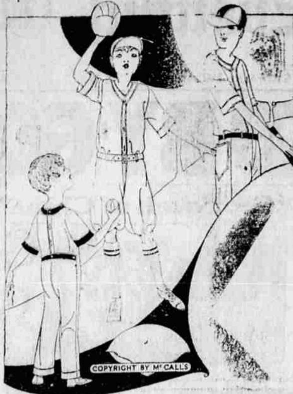
Here's a baseball suit that is calculated to make any young baseball enthusiast feel like a Babe Ruth. For those who have not yet dedicated their futures to the Yanks, Giants or the Red Sox there is the over-all suit. This one gives playing a carefree, mud-slinging advantage.