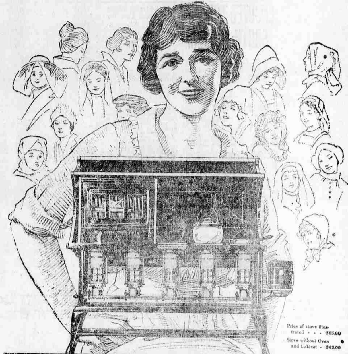
Price of stove illustrated - $85.00 Stove without Oven and Cabinet - $43.00

O. F. COOLIDGE, La Grande, Oregon. HAINES COMM. CO., Haines, Oregon. L. B. RUSSELL, North Powder, Oregon.