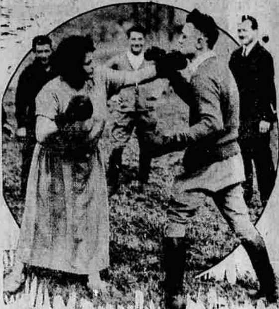
Mrs. Eugene Criqui recently arrived from Paris to see her husband, featherweight champion of Europe, fight Johnny Kibane for the world title. Here Mrs. Criqui hands her spouse a wicked one on the jaw at his training quarters at Manhasset, Long Island. Maybe you don't believe he's his sparring partner, but it makes a good picture, anyway.