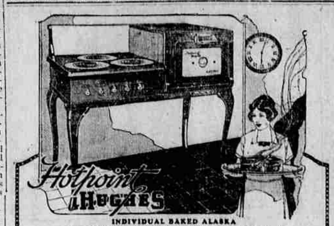
Hotpoint HUGHES INDIVIDUAL BAKED ALASKA

appears at midnight and gives forth a fiery glare as if it were a cloak of flame. These are thrilling scenes galore. But—and this should be noted especially—the picture at no time is permitted to become revolting or offensive in its pietization of the horrors caused by the blazing brute on the moors. Among the outstanding scenes are the hunting down of the deer its death at the hands of the great detective; the solving of the curse of the Baskervilles; the death of one of the plotters in the bog; the adventure in the cave and many others that combine to make "The Hound of the Baskervilles" entertainment of the most thrilling and interesting character. Also showing another "Fighting Blood" picture.