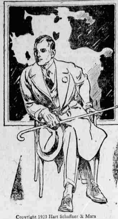
Copyright 1923 Hart Schaffner & Marx