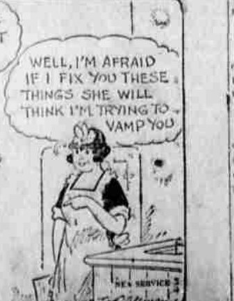
Lena Would Play Safe